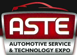
Exhibit Space Agreement

1. AGREEMENT. The Exhibitor agrees to rent from Expo Producer and Expo Producer agrees to rent to the Exhibitor, exhibit space in the Automotive Service & Technology Expo 2014 (ASTE 2014) at the location, rental rate and times as specified in the ASTE 2014 Vendor application.